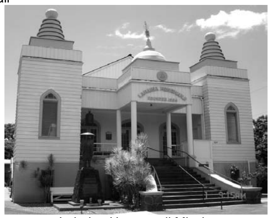
Lahaina Hongwanji Mission