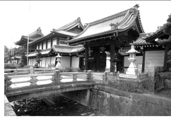
Nishi Hongwanji in Kyoto, Japan