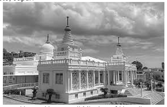
Honpa Hongwanji Mission of Hawaii